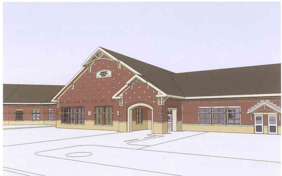
A rendering of the new Idlehurst Elementary School in Somersworth, N.H.