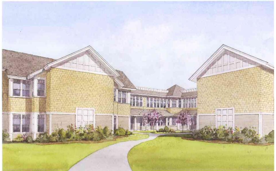
An artist's rendering of the new Mountain View Nursing Home in Ossipee, N.H.